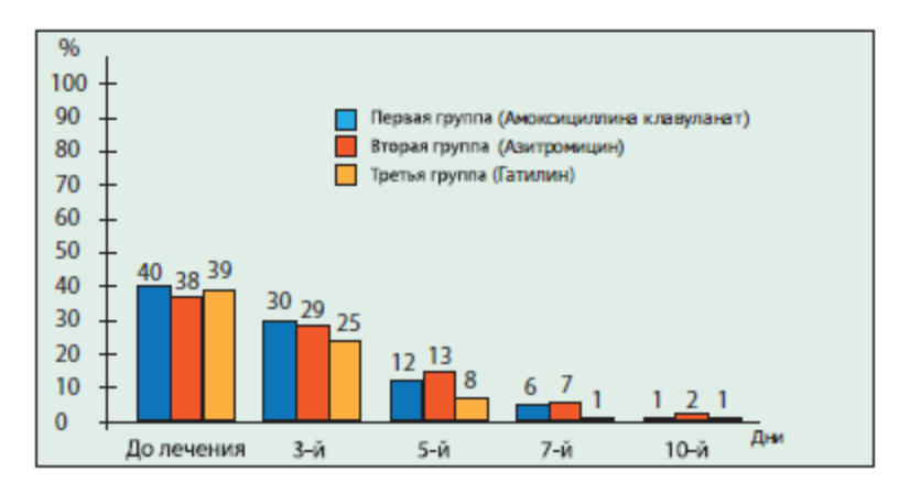
Fig. 2. Dynamics of the symptom of improvement of hearing (relative indicator: 0 % proper hearing, 100% –hearing loss)

Fig. 1. Dynamics of the main symptoms in the course of treatment (a relative indicator: 0 % (0 points) – absence of symptoms of the disease, 100 % (10 points) –maximum expression of symptoms of the disease)